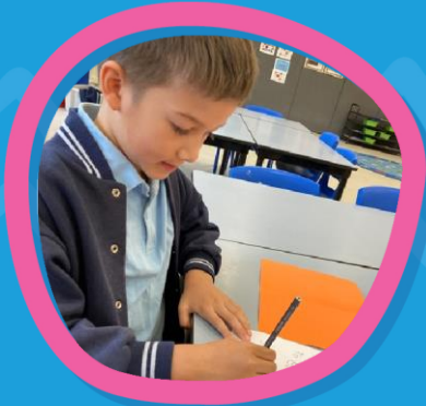
Making a Good Bye Card

We would like to acknowledge the traditional owners of the land the Wurundjeri People, and we pay our respects to the Elders, past, present and emerging.