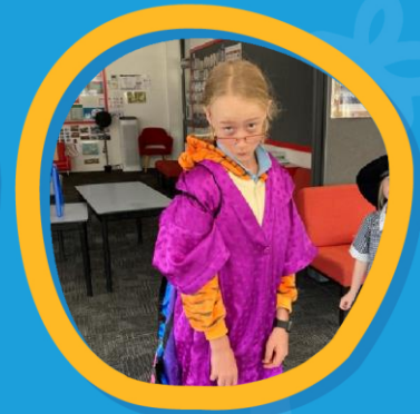
Dress Up Fun!

Hi families, we have some big and exciting updates!